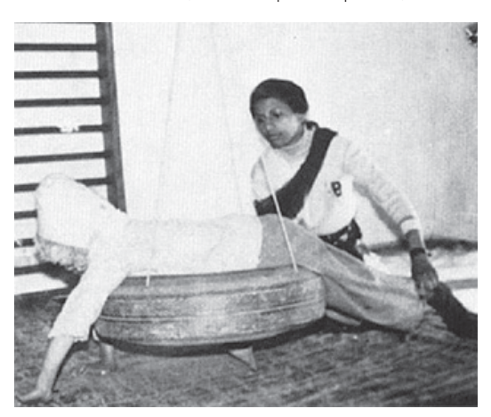
Helping a child begin to learn to move.

12-minute radio broadcasts about home rehabilitation started in 1984. (The scripts for these, which are excellent, are available at the website of Disability World, www.disabilityworld.org/01-03_02/arts/afghan.shtml.) An article on handicrafts by which disabled young people can contribute to their family's income is at www.independentliving.org/docs3/milesm1987a.html. (See examples on p. 510.)