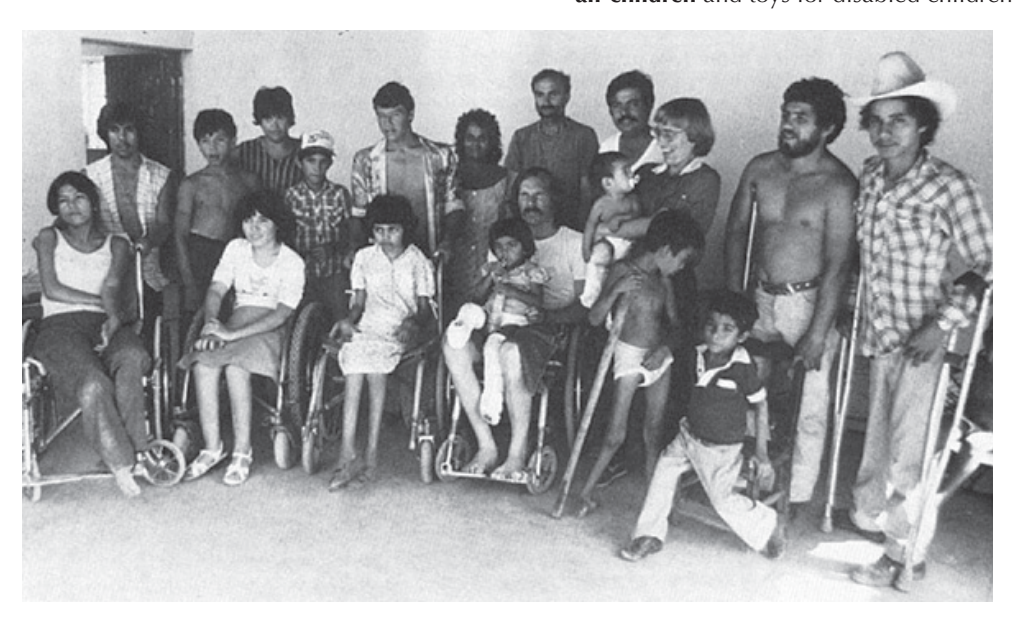
Part of PROJIMO team

PROJIMO is based in one small village but serves children and their families from neighboring towns and villages, and even from the closest cities (over 100 miles away). Local villagers cooperate by taking visiting disabled children and their families into their homes. Schoolchildren help make the playground-for-all-children and toys for disabled children.