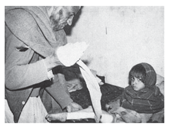
Splinting a leg to straighten a knee contracture.

The program began in Peshawar in the Northwest Frontier Province of Pakistan as a small play group for 8 mentally handicapped children. In 1978 the 3 Pakistani staff were joined by a Welsh special education teacher and her husband. During the next 7 years the play group grew to become a community rehabilitation and resource center with daily participation of 70 physically and 40 mentally and multiply disabled children.