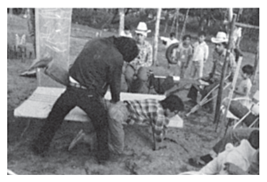
Most of the training of the PROJIMO team members is through guided 'learning by doing'. Here, PROJIMO workers practice exercises under the guidance of a visiting physiotherapist. Parents, children, and anyone who wants to learn are welcome.