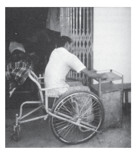
A worker in the CRP-made wheelchair makes a bedside stand to be sold to a local hospital.

For more information on this center and its equipment, see p. 199, 483, and 509.