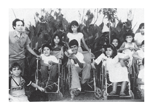
A few of the children of Los Pargos with one of their teachers, on the left. The teacher, severely affected by cerebral palsy, has a personal understanding of the children's needs.

Los Pargos has set up its own special education program and has convinced the local university authorities to make space available in a local prep school after school hours. Some of the teachers, who are volunteers, are also disabled. This makes them good role models for the children