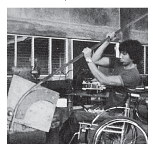
The ORD team of disabled workers produced its own high-quality metal tubing wheelchairs, adapted for rough ground (see p. 622) at a cost far lower than standard commercial wheelchairs.

Two young North Americans who both have spinal cord injuries, one a peer counselor for the disabled and the other a wheelchair designer and engineer, helped ORD organize and set up a small wheelchair factory.