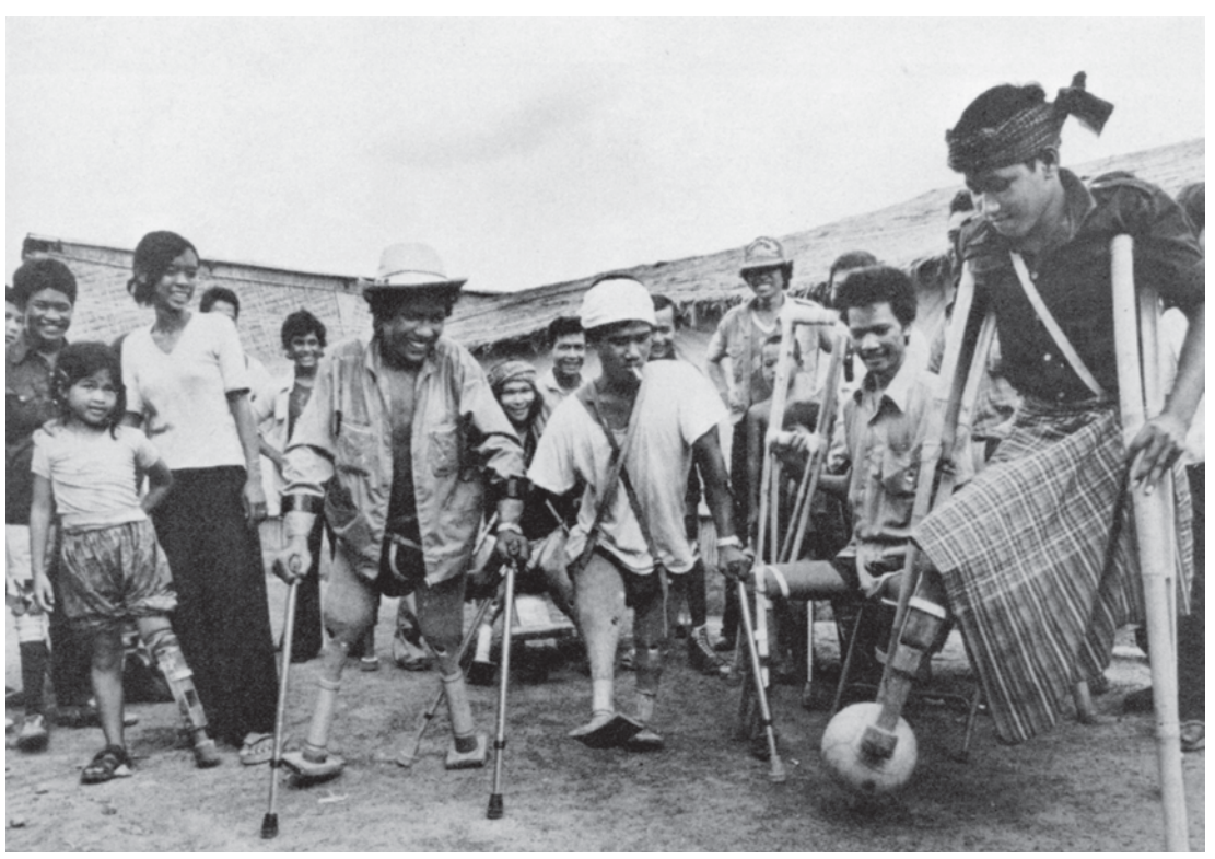
Aids For Living (Healthlink Worldwide)

The spirit of hard work and friendship in shops run by amputees does much to help recent amputees accept the loss of their limbs and get back into the adventure of survival.