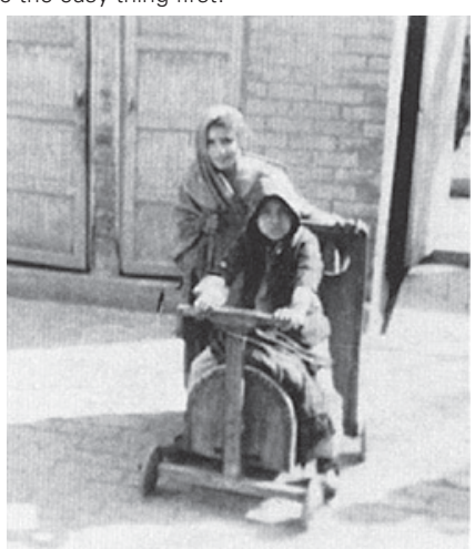
Going for a ride.

The Peshawar program has succeeded in promoting community-directed rehabilitation activities in much of the Northwest Frontier through organizing an already motivated group (parents of disabled children). One of their keys to success is to: "Do the easy thing first!"