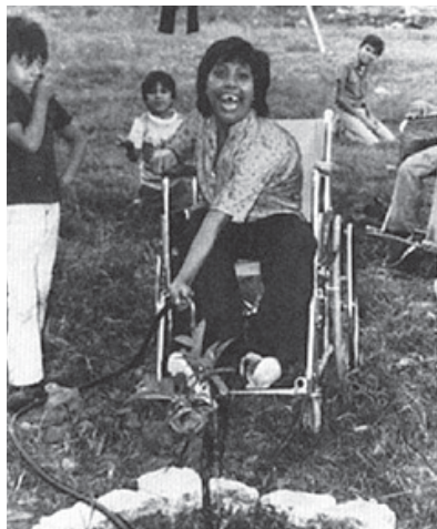
One of the children of Los Pargos waters a young tree—part of an orchard the parents and children are planting together.

Los Pargos, located about 100 miles from PROJIMO, often takes groups of 'parguitos' (disabled children) to PROJIMO for rehabilitation services that they have trouble getting in the city. Also, their visit to PROJIMO is an adventure into the country for these city children and their parents.